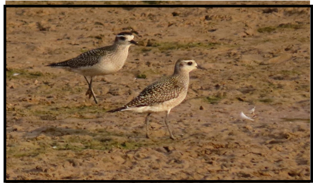
American Golden Plovers Bill Oyler found at Antrim Commons Road ponds