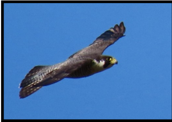
Peregrine Falcon seen at Gettysburg Regional Airport