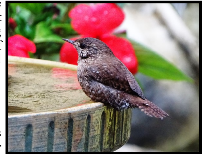
First migrant to arrive on Heisey Road, a Winter Wren.

There's a change in the air. Leaves crisp underfoot. Wood smoke wafts on evening breezes. The sun is gentler on my shoulders. Autumn is here, and with it the changes I expect and anticipate. Although a line of geese crossing the sky is probably just heading to a different pond for the night, I can't help feeling the same awe as I did when, as a youngster, I'd leap out the door the minute I'd hear the tinny murmuring heading my way in an autumn sky. A large "V" of conversational Canada geese never ceases to thrill my memory cells.