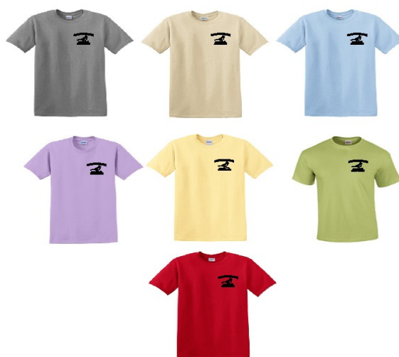
8/29/19 Conococheague Audubon T-Shirt Mock Ups Left Chest

The sizes and prices are: S, M, L, and XL -- $8.00 2X -- $10.00 3X -- $12.00