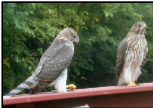
On an August morning, two young hawks share space on a deck railing in a neighborhood south of Chambersburg. Bob Keener identified them as juvenile Cooper's Hawks.

Since July, 20 inmates at Huntingdon State Correctional Institution have been participants in a pilot Riparian Forest Buffer Vocational Training program that will help selected prison inmates re-enter the work force while they learn about conservation efforts in the state.