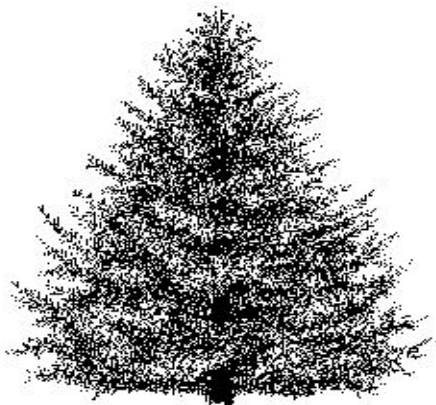
Help Save the Trees

This issue of the newsletter appears on our website in the Newsletter section. Visit the CAS website by going to the National Audubon website http://www.audubon.org/ . Choose States and Chapters, select Pennsylvania as the state to view, and then click on the Conococheague Audubon link. Or, you may go directly to our site by using the URL http://home.comcast.net/~audubonc/ . If you bookmark the URL, it's easy to revisit the site!